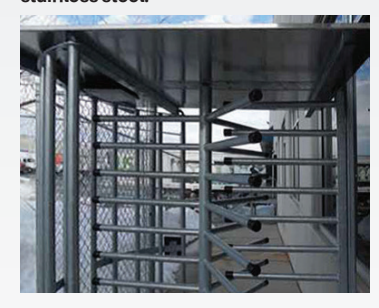
Shown (below) with matching HS336 full-height gate.

Optional full canopy available in stainless steel.