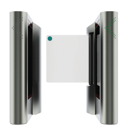
Single Swing Gate Door